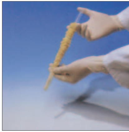
2. Slip the latex cover on the syringe and push the transmission gel into the tip of the cover.