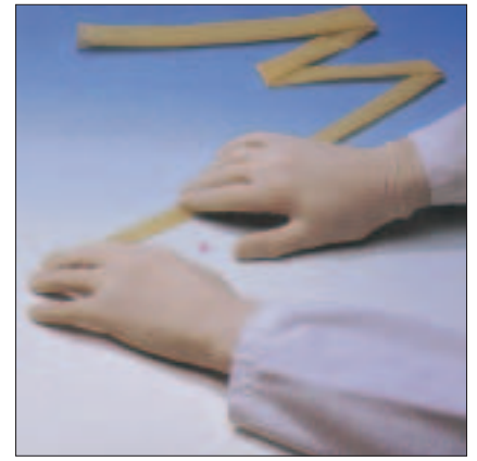
3. Parcel the gel out.