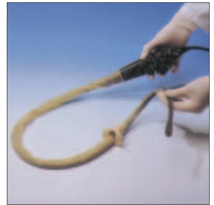
6. The probe is now ready for use.