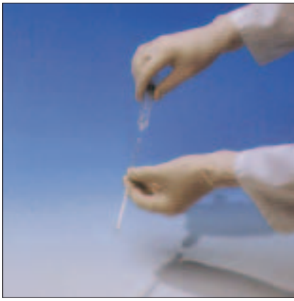
1. Remove the cap and fasten the connector to the syringe.