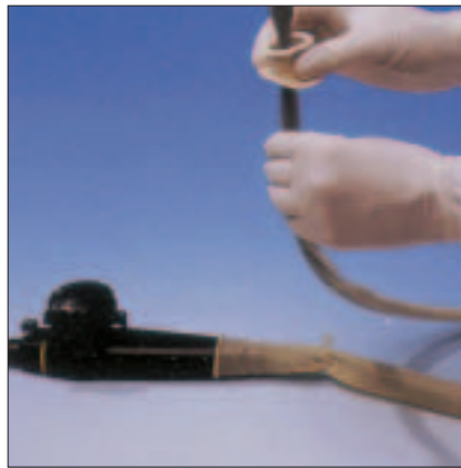
5. Fasten the latex cover by means of the twistlock and apply the biteguard.